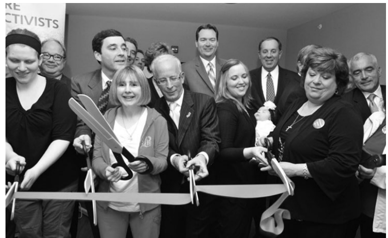
Residents and officials cut the ribbon to celebrate the Kershaw Commons grand opening!

programming and support services provided by the National Multiple Sclerosis Society. Residents have access to a variety of recreational and social programs such as tai chi and yoga, ongoing educational lectures, self help groups, and easy access to