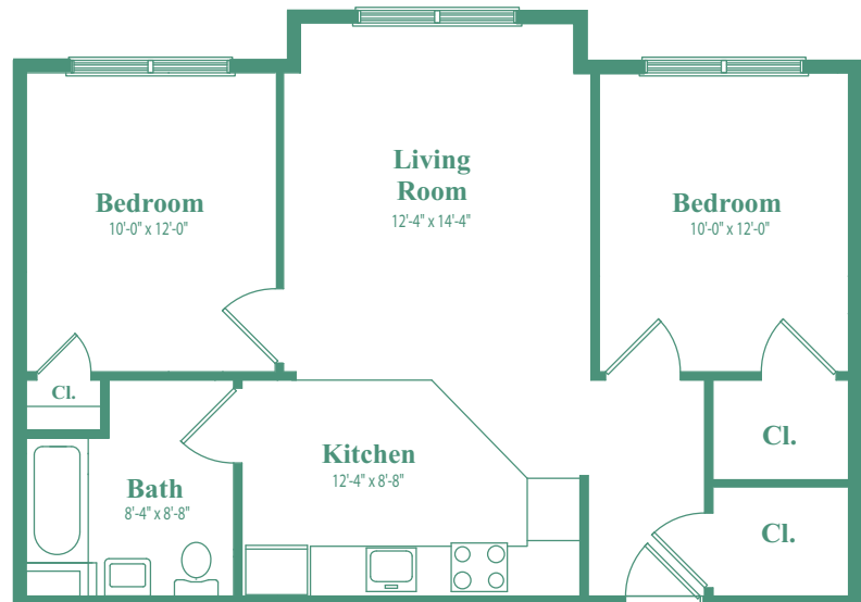
2 Bedroom approx. 753 sq. ft.