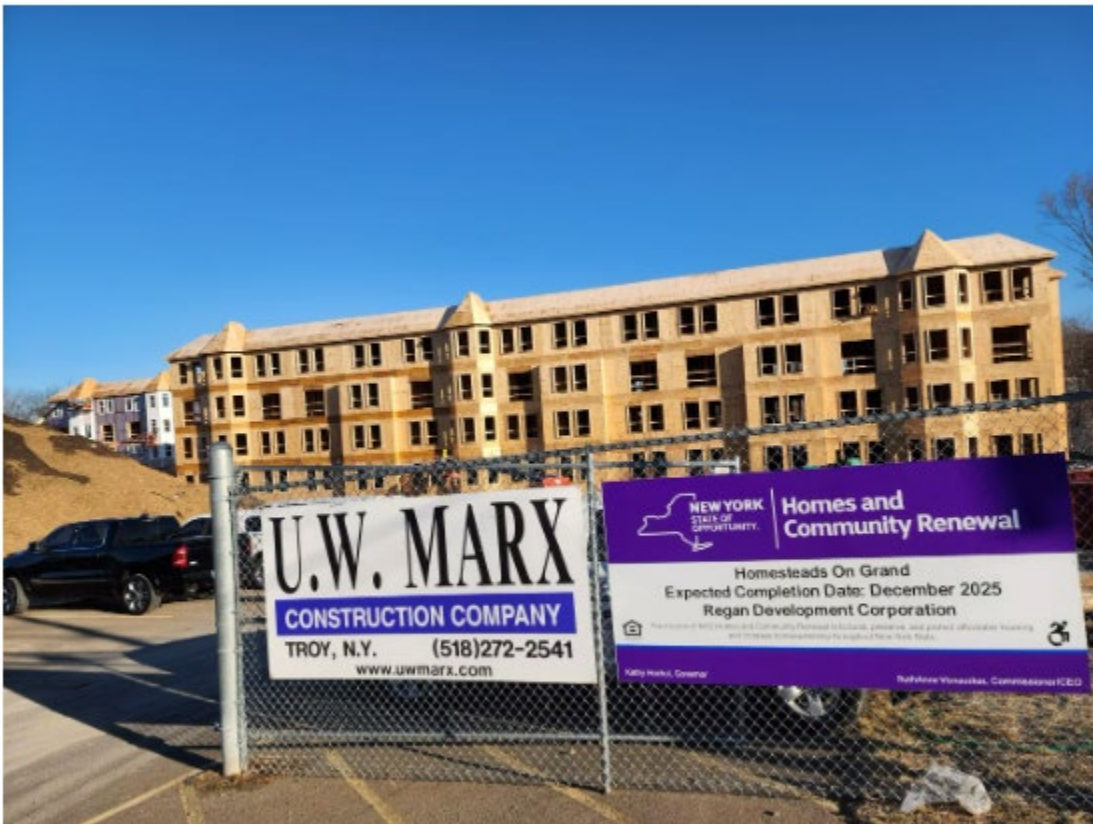
The future Homestead on Grand complex in Johnson City on March 18, 2025.