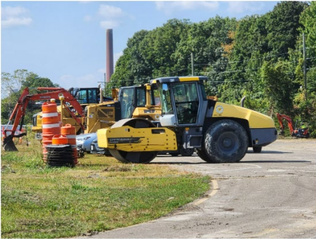
FLASHBACK: Construction equipment staged at the project site at 333 Grand Avenue on September 20, 2024.