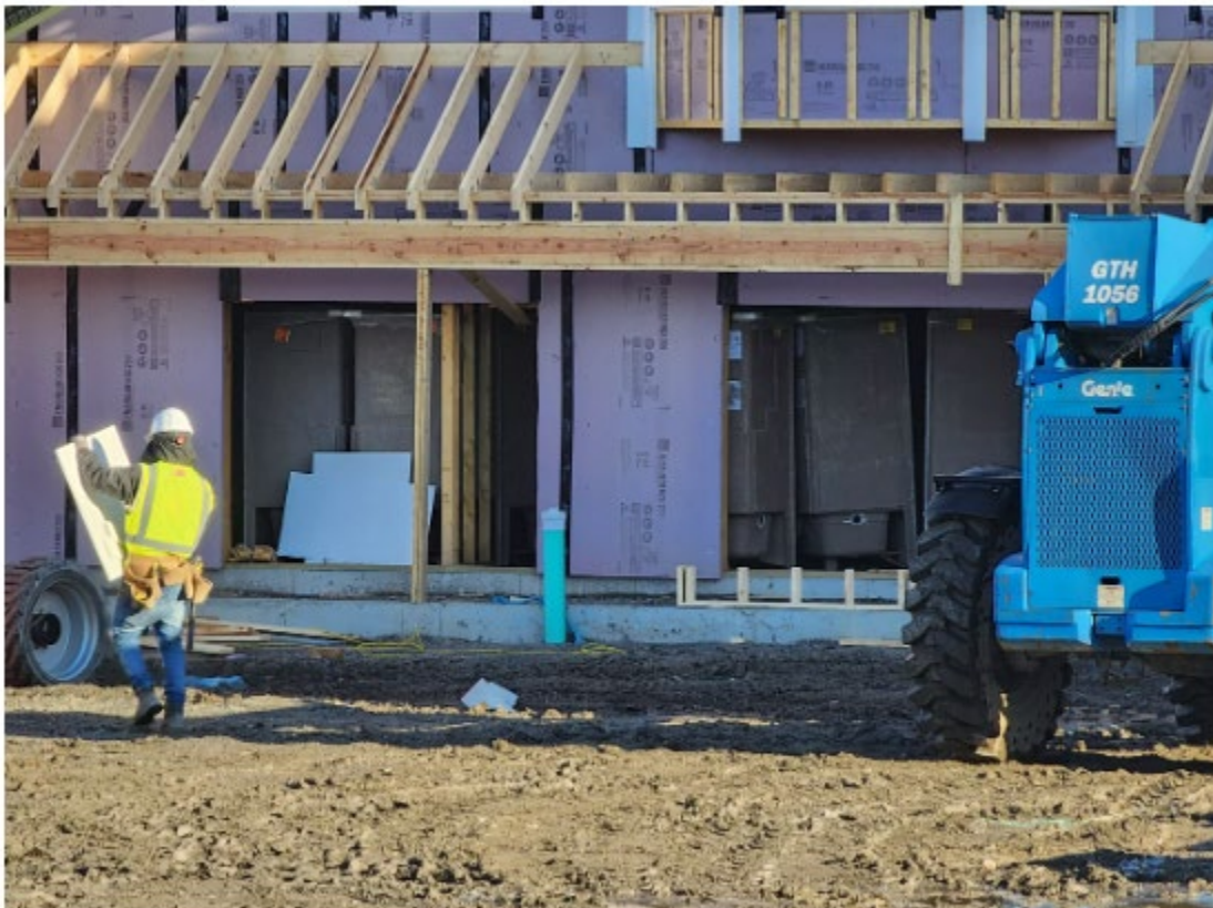
A worker at the Grand Avenue construction site on March 18, 2025.

U.W. Marx Construction Company of Troy is the project's general contractor. The developer is Regan Development Corporation of Westchester County.